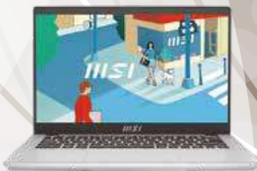
MSI Modern Series