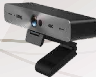
Video Conference System