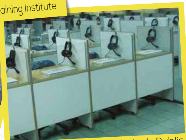
Language Lab at Bangladesh Public Administration Training Centre