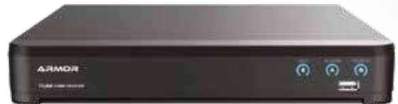
Armor CCTV Solutions