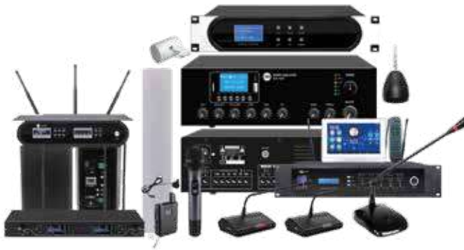
CMX Sound System