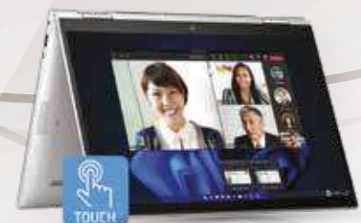
Dell Laptop & Notebook