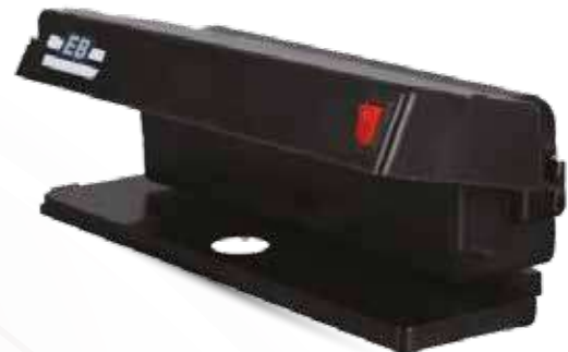
Fake Note Detector