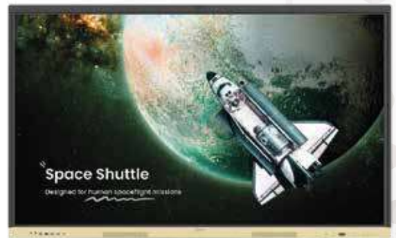
BenQ Interactive Flat Panel