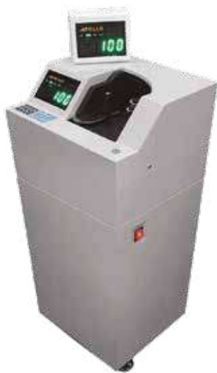
Apollo Floor Type Note Counting Machine