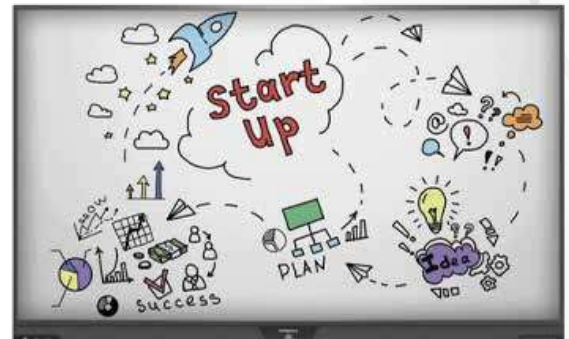
Hitachi Interactive Flat Panel