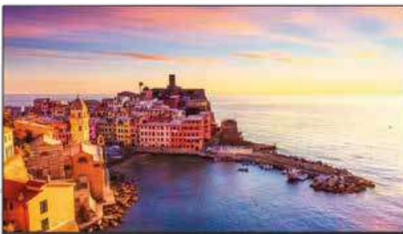
LG Commercial Tv