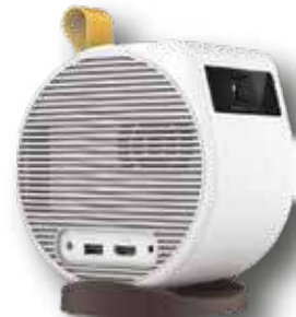
BenQ Portable Projector