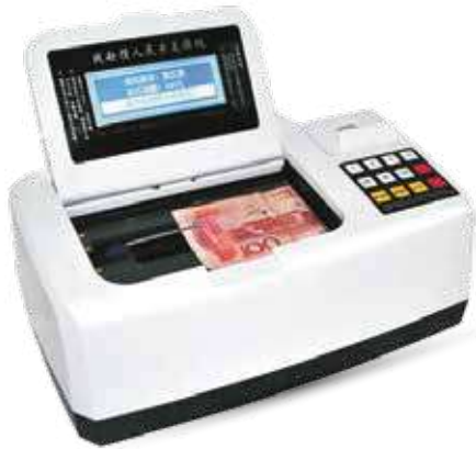
Note Binding and Measurement Machine