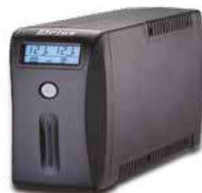
Aplus Online UPS