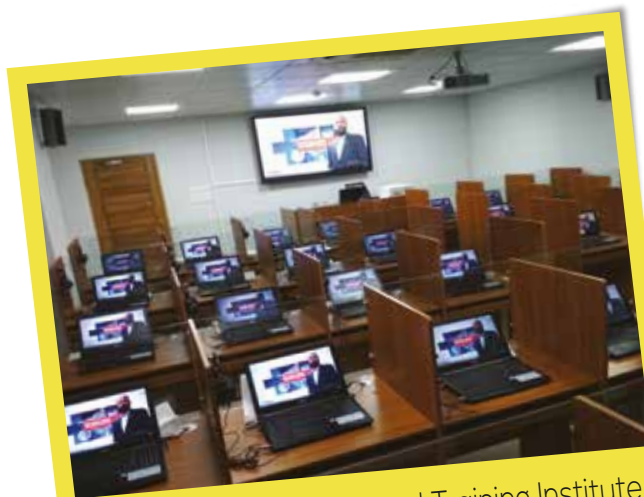
Language Lab at Electoral Training Institute