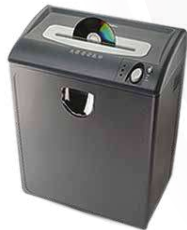
GBC/ Rexel Paper Shredder