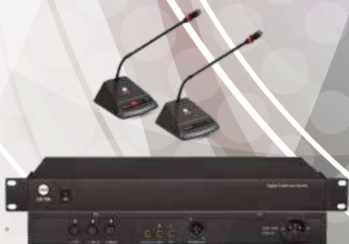
HTDZ Conference System