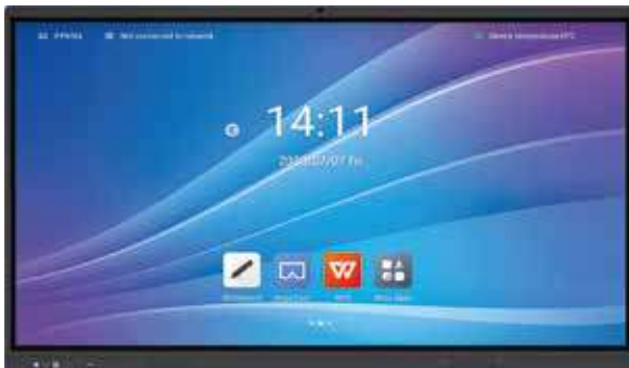
Armor Interactive Flat Panel