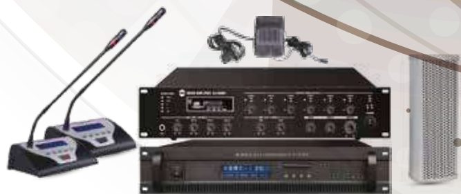
CMX Wireless Conference System