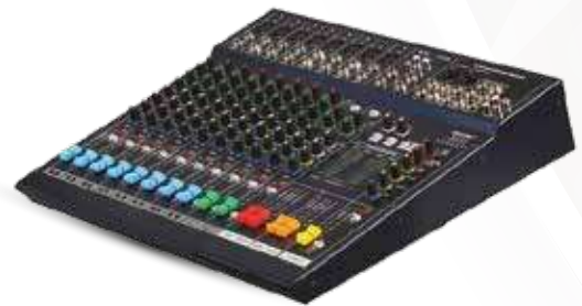
Pro Mixing Console