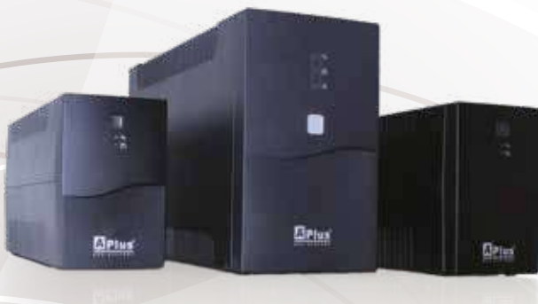
Aplus Offline Ups