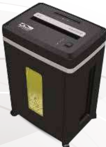
Lexin Paper Shredder