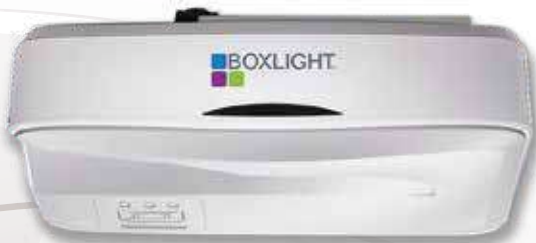
Boxlight Laser Projector