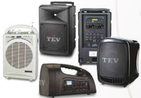
TEV PA System