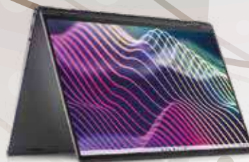
HP Laptop & Notebook