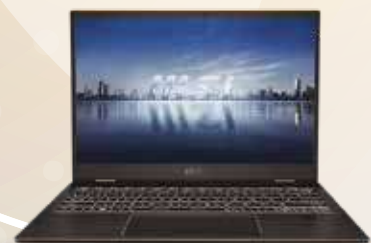
MSI Summit Series