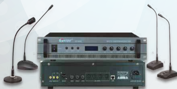
BXB Conference System