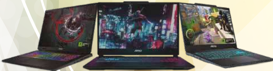
MSI Gaming Series