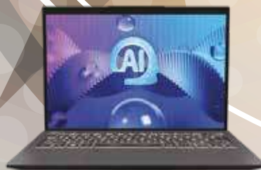
MSI Prestige Series