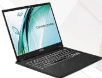
MSI Commercial Series