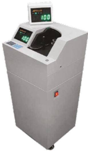
Apollo Floor Type Note Counting Machine