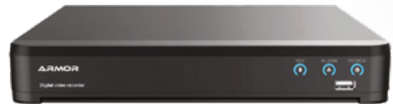
Armor CCTV Solutions