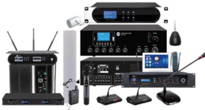
CMX Sound System