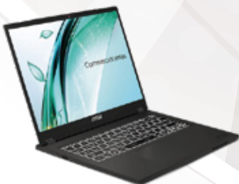
MSI Commercial Series