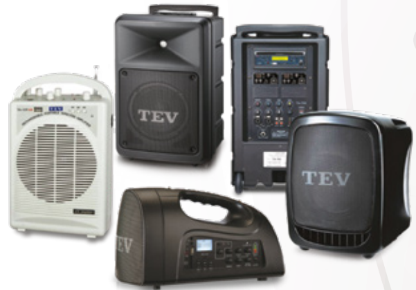
TEV PA System