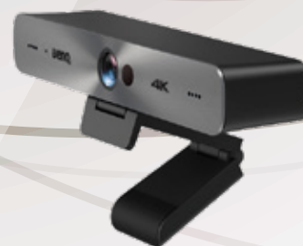
Video Conference System