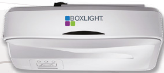
Boxlight Laser Projector