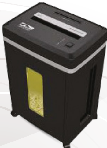
Lexin Paper Shredder