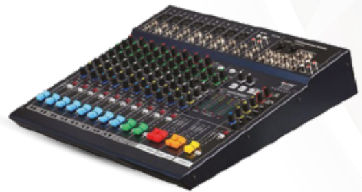
Pro Mixing Console