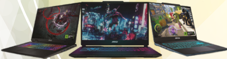
MSI Gaming Series