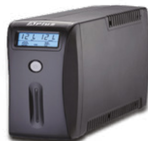
Aplus Online UPS