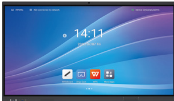
Armor Interactive Flat Panel