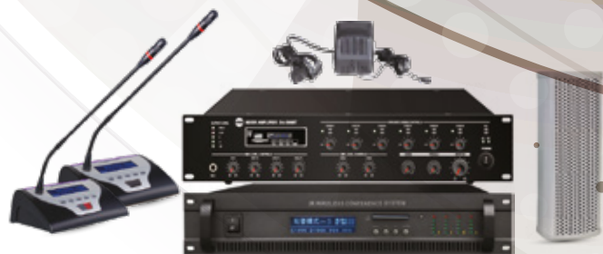
CMX Wireless Conference System