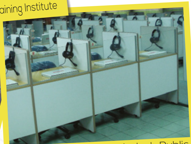
Language Lab at Bangladesh Public Administration Training Centre