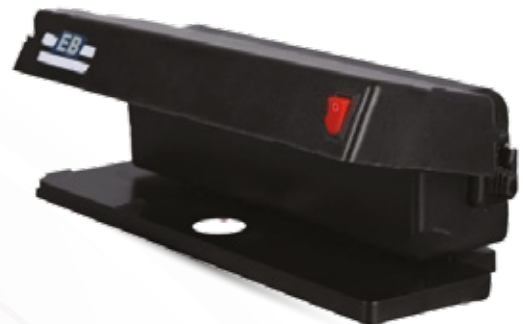
Fake Note Detector