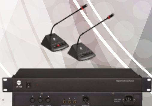
HTDZ Conference System