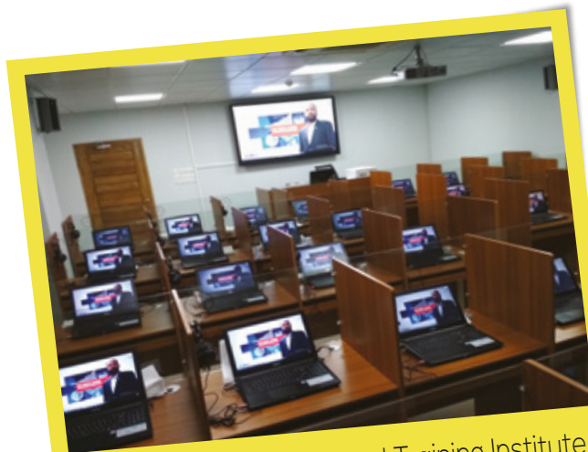
Language Lab at Electoral Training Institute