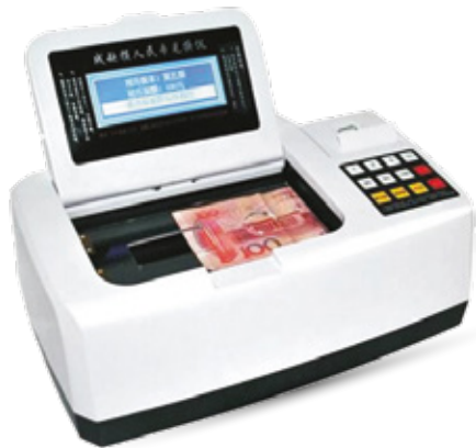
Note Binding and Measurement Machine