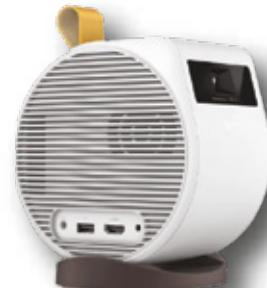
BenQ Portable Projector