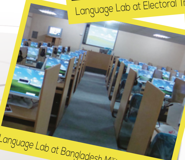
Language Lab at Bangladesh Military Academy