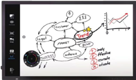
LG Interactive Digital Board