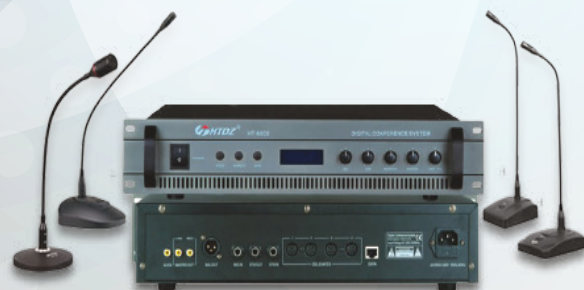
BXB Conference System