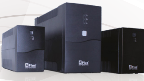
Aplus Offline Ups