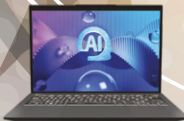
MSI Prestige Series