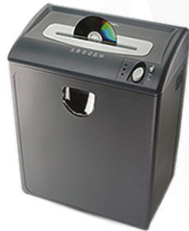
GBC/ Rexel Paper Shredder