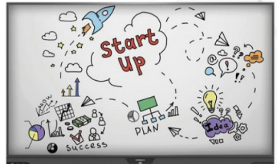
Hitachi Interactive Flat Panel