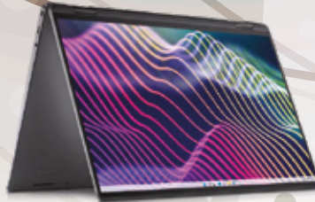
HP Laptop & Notebook