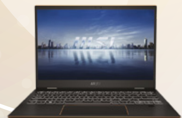
MSI Summit Series