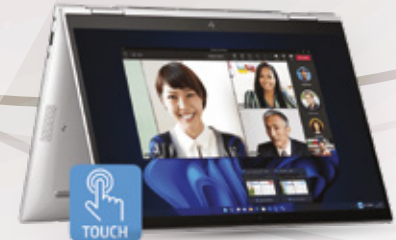
Dell Laptop & Notebook