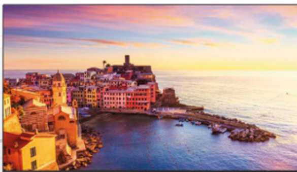
LG Commercial Tv