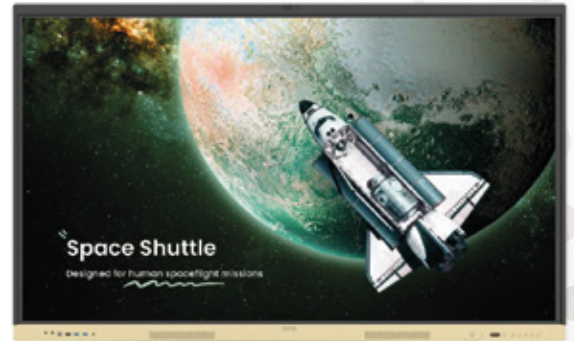
BenQ Interactive Flat Panel